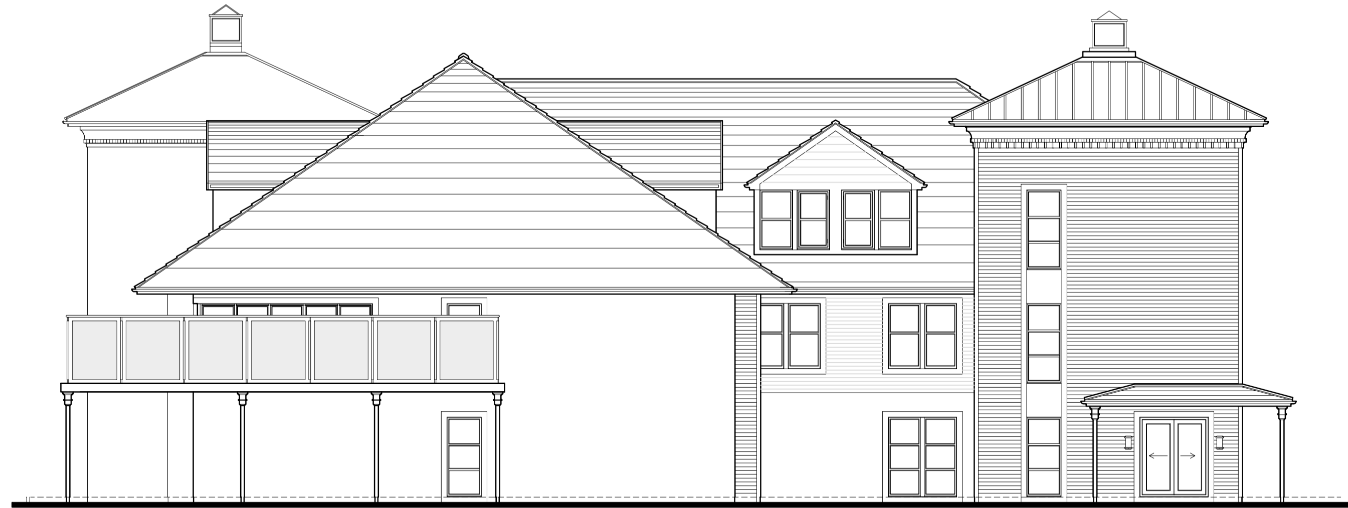
proposed SOUTH EAST elevation (B)