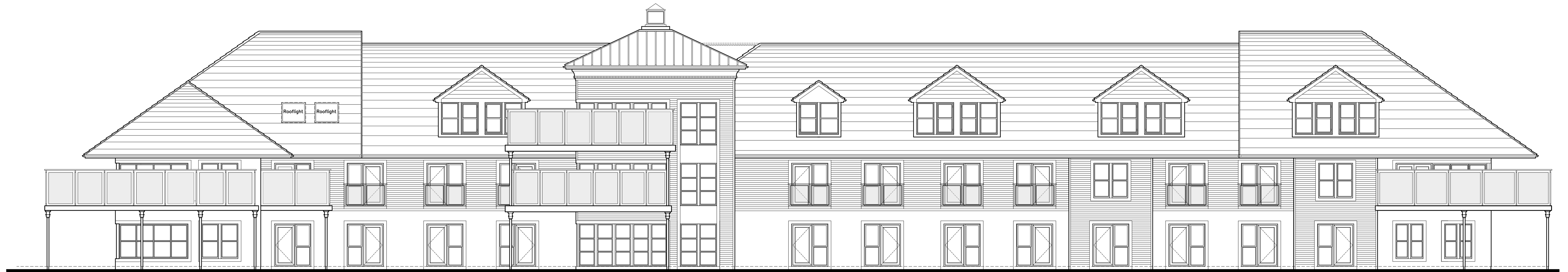
proposed SOUTH WEST elevation (C)