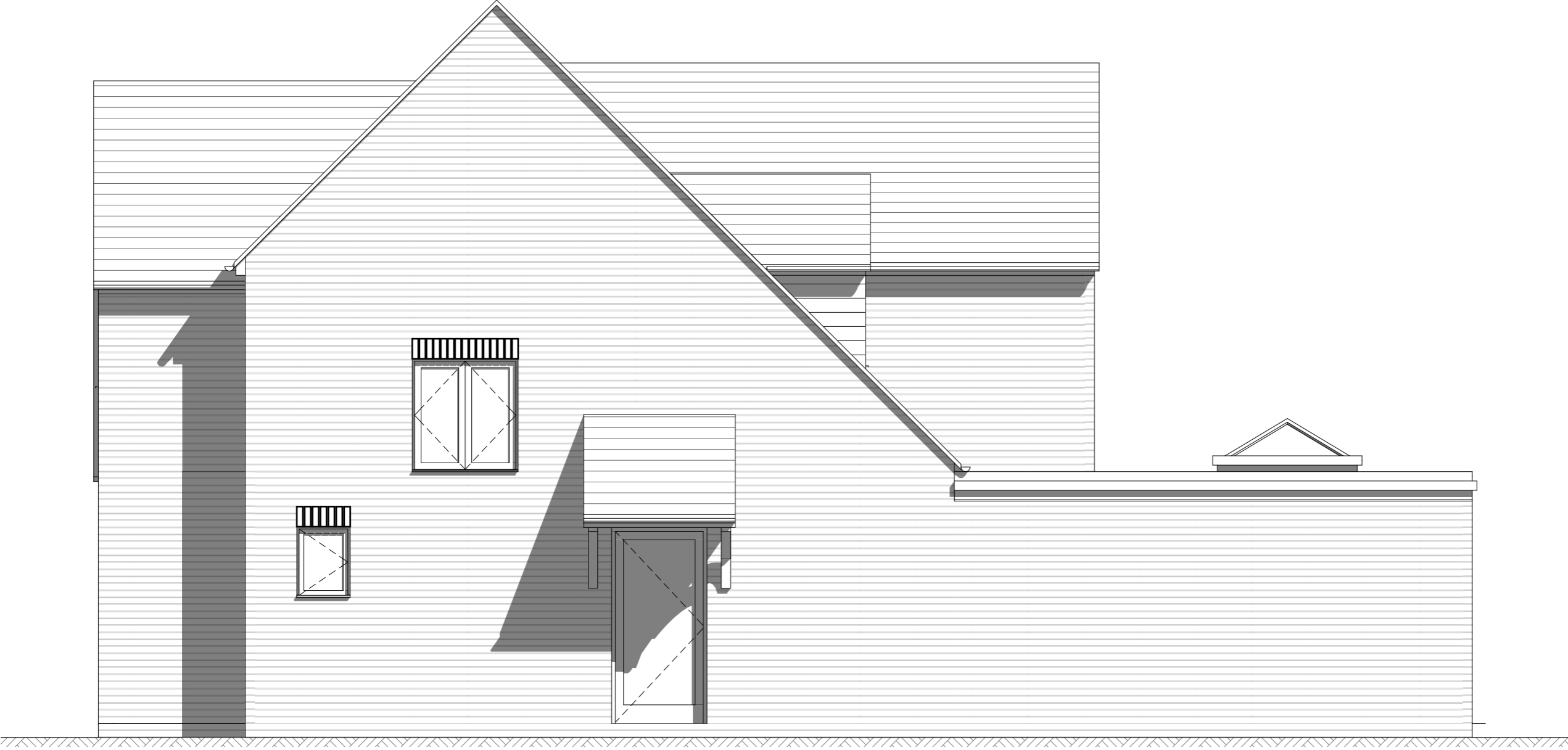
SIDE 1 ELEVATION