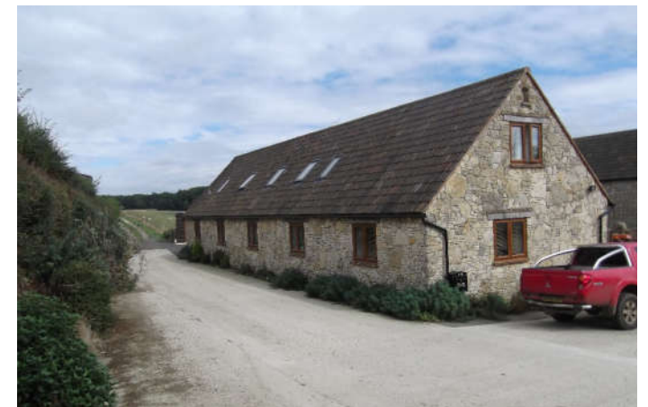
Residential change of use approved for 2 units by prior approval process under P14/51278/PAR. Proposal to move agricultural workers restrictions to Bramble Cottage and Blackberry Cottage