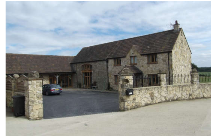
Alterations and extension to stone barn to form a dwellinghouse approved under P11/W0903, with agricultural workers condition. Proposal to remove agricultural workers restriction from Breach Farm Barn